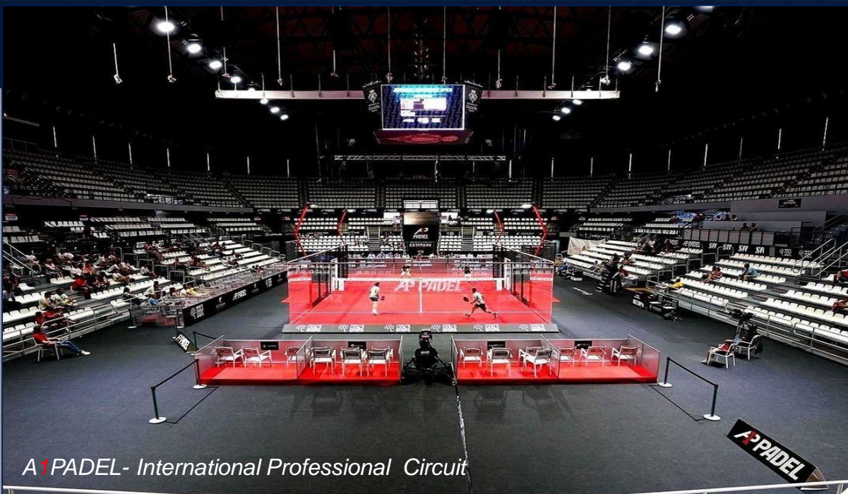
A1 PADEL- International Professional Circuit