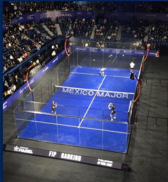
Central Court Major Premier Padel- International Professional Circuit